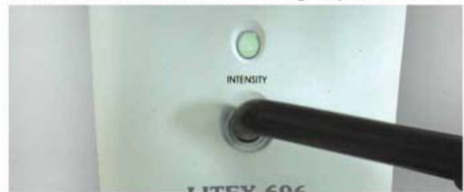
Built-in Light Intensity Indicator.